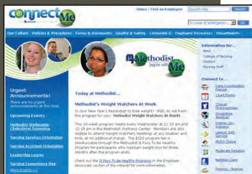
Methodist Medical Center of Illinois Intranet